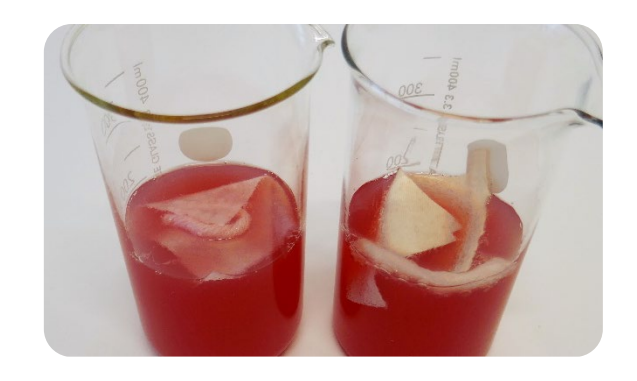
What differences can you notice?